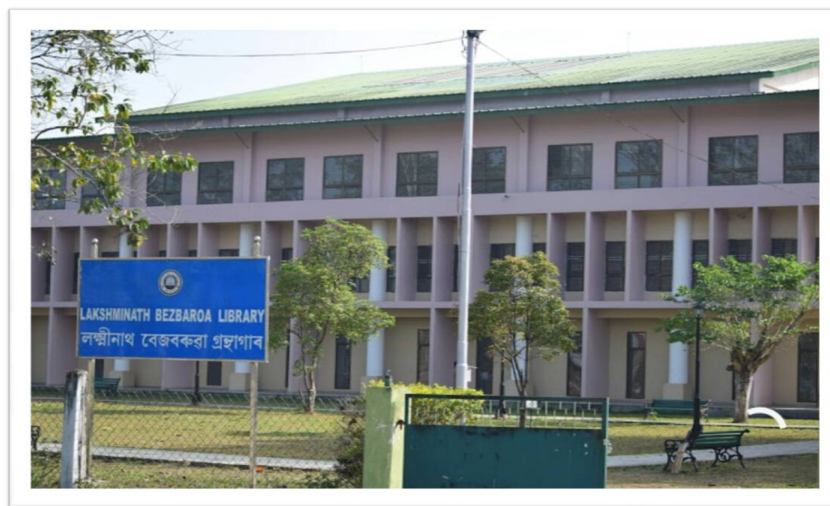
Pic 3.7.1: Outside view of Lakshminath Bezbaroa Library, Dibrugarh University

Lakshminath Bezbaroa Library is the Central Library of Dibrugarh University. Though Dibrugarh University was established in the year 1965, the university library came up only in the month of April of 1967 and initially started functioning with merely 997 books positioned in a room in the D.H.S.K. Commerce College, Dibrugarh. The Library was shifted from the D.H.S.K. Commerce College to the new permanent University campus at Rajabheta sometime in between the months of August-September of the same year and housed in an old tea factory along with some other departments and administrative blocks. The Library collections are as follows: Books – 229573, Journals – 143, Bound Periodicals – 22685, Newspapers – 21, Theses & Dissertations – 4579, E-Journals – 10000, CDs/ DVDs – 750. Other collections are Census Data, Govt. of Assam's Statistical Reports, Gandhi and Nobel Laureate Collection of about 200 vols, North East Collection of over 4000 books on N E India. The Library remains open from 8.30 am – 7.30 pm on working days ( https://www.dibru.ac.in>lnblibrary ).