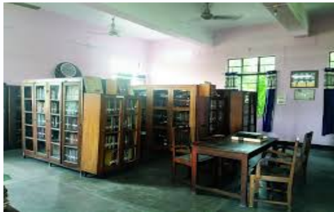
Pic 3.5.2: K K Handiqui Collection of Krishna Kanta Handiqui Library, Gauhati University