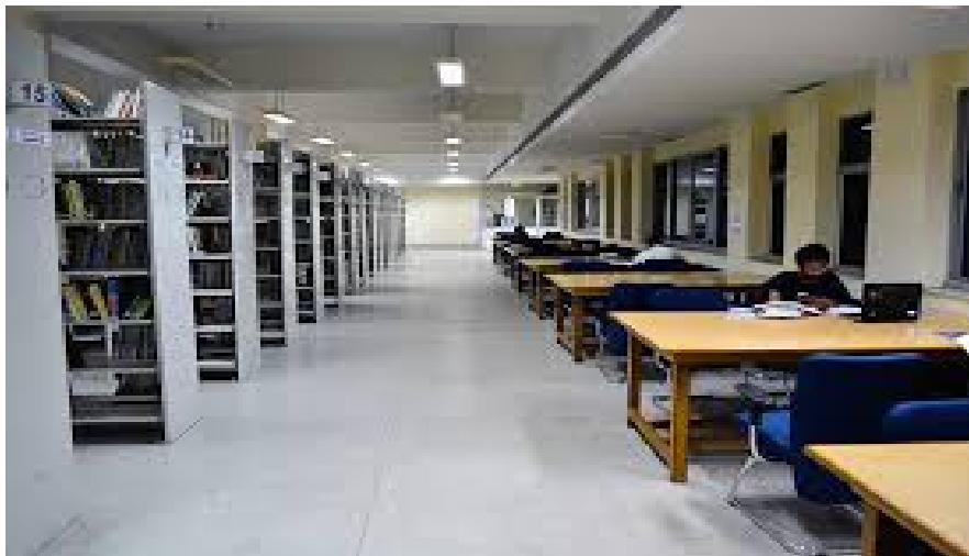
Pic 3.6.2: Inside view of Lakshminath Bezbaroa Central Library (LBCL) IIT Guwahati Library