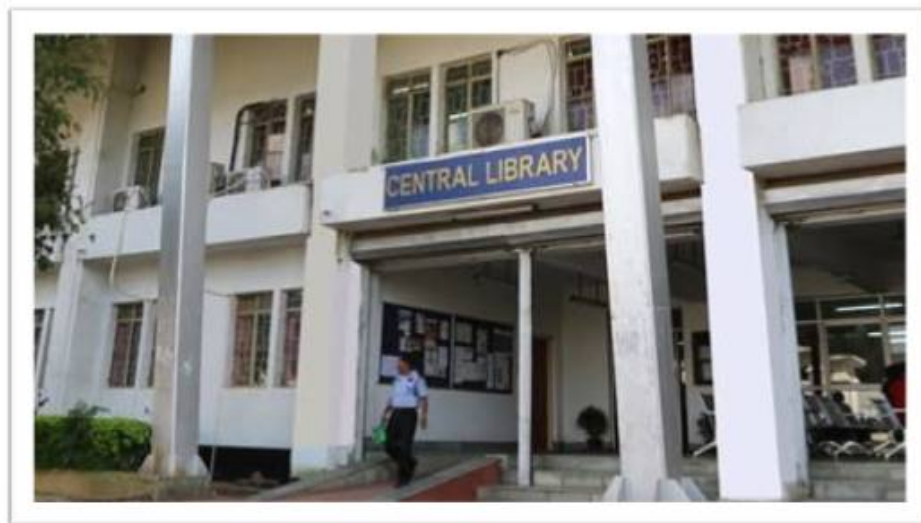
Pic 3.4.1: Front view of Central Library, Tripura University

other staff of the University. Over the years the central library has developed a lot and become the most richest higher educational library in the state. The library is housed in a 3 storied building having 2715 sq mt (approx) floor area. The collection of the Library is as follows: Books-: 122095, Current Periodicals – 137, Back Volume – 6920, Newspaper subscribed – 28 and E-journals – 8000. The Library remains open from 9.30 am to 8.00 pm from Monday to Friday and 11.00 am – 4.00 pm on Saturday & Sunday ( https://www.tripurauniv.in>library ).