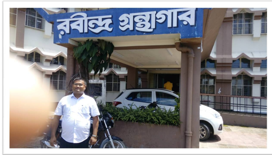
Pic 3.11.2: Front View of Rabindra Library, Assam University