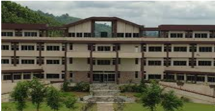
Pic 3.6.1: Front view of Lakshminath Bezbaroa Central Library (LBCL) IIT Guwahati Library