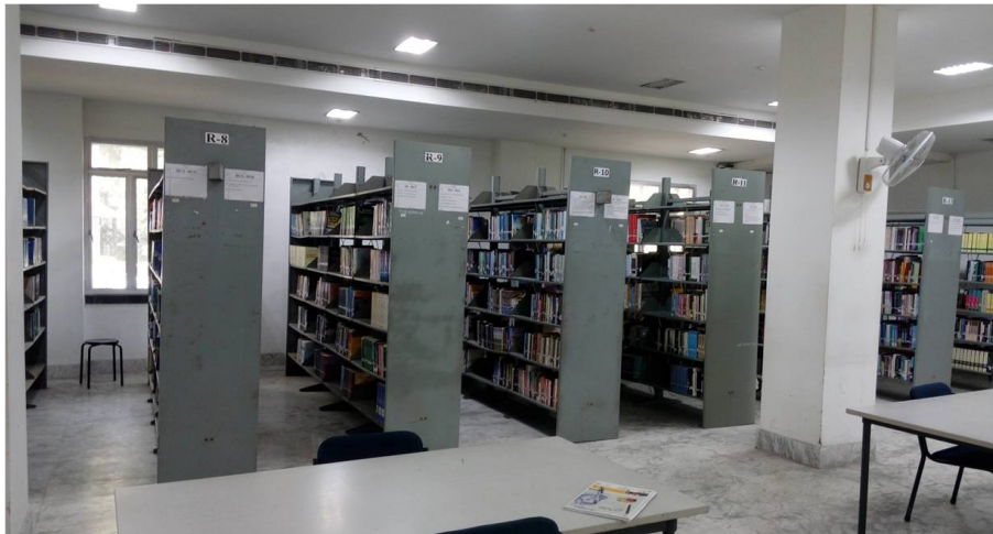
Pic 3.3.2: Stack area Central Library, Tezpur University