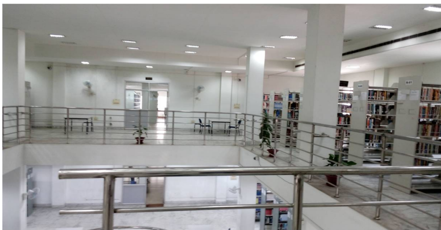
Pic 3.3.1: Inside Central Library, Tezpur University

Central Library is the focal point of all user community of Tezpur University. The Library caters to the educational and research needs of the academic community and its resources are consulted by scholars from all over the country. Central Library started functioning since 1994. At present the library holds about 83400+ books, 10000+ e-journals and 9616 back volumes of journals (as on 1.10.2018). Apart from the online journals and database provided by e-SodhSindhu consortium and DeLCON consortium, the Library also holds more than 2552 CDs scattering to different thought contents. Library users can access book database, theses database, journal database, e-journals and other e-resources from any terminal within the University Campus. Central Library remains open throughout the year. Only reading facility is available on national holidays. ILMs used in the library is Libsys. OPAC and Web OPAC are also available in the Library. Online renewal and reservation can be made through OPAC ( www.tezu.ernet.in/library ).