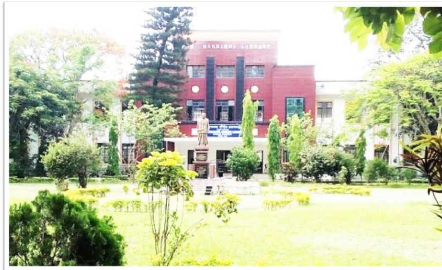
Pic 3.5.1: Front view of Krishna Kanta Handiqui Library, Gauhati University