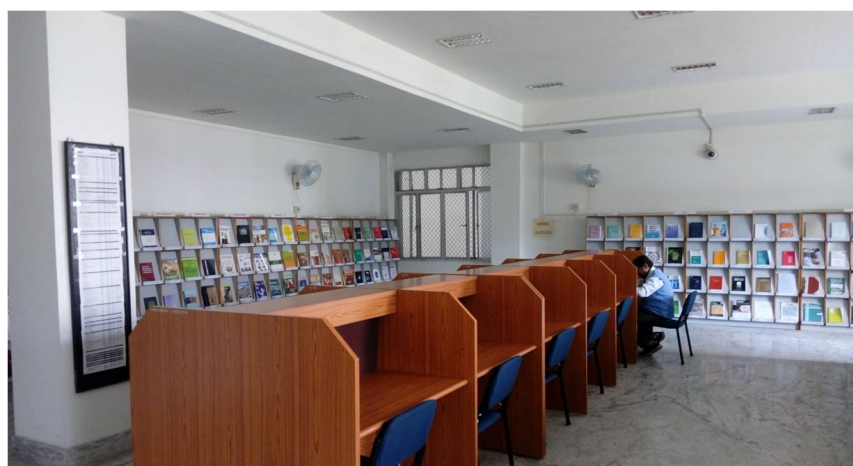
Pic 3.3.3: Reference section, Central Library, Tezpur University