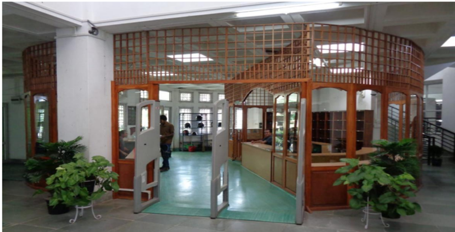
Pic 3.1.1: Main Entrance, Central Library Mizoram University