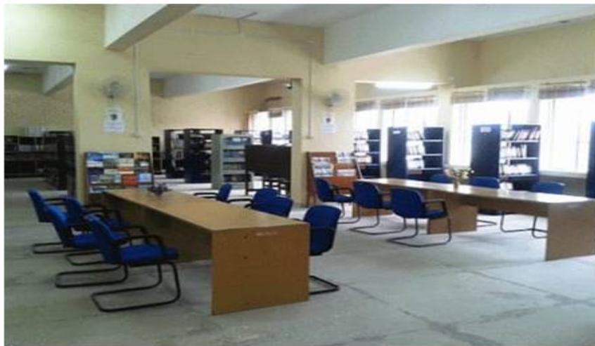
Pic 3.2.2: Journal Section of Central Library, Nagaland University