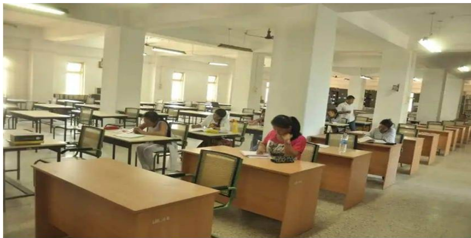
Pic 3.10.2: Reading room inside Manipur University Library