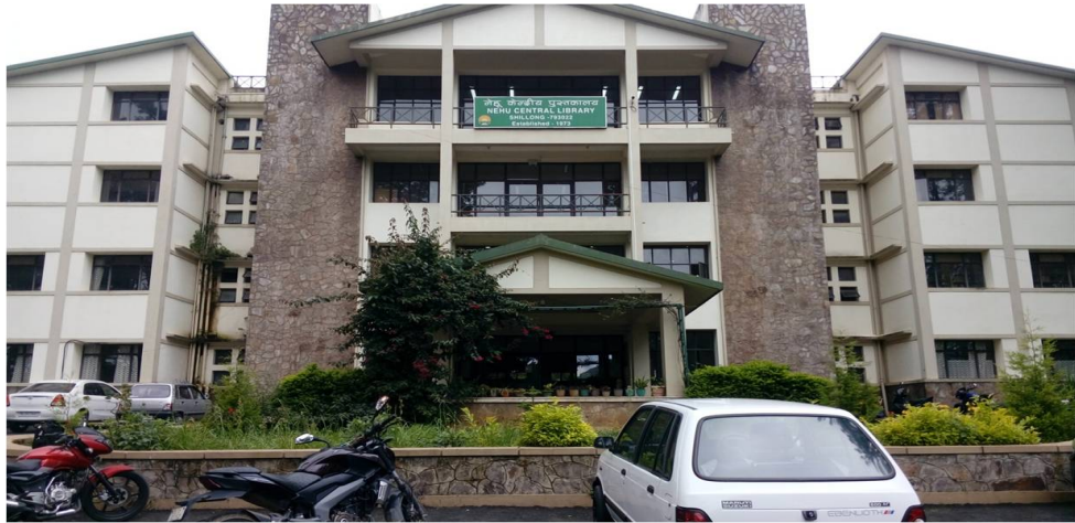
Pic 3.8.1: Front view of Library, North Eastern Hill University