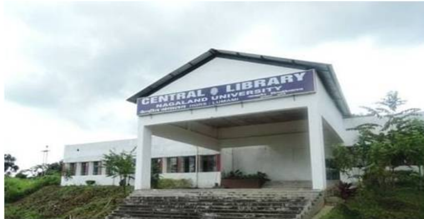
Pic 3.2.1: Front view of Central Library, Nagaland University

automation. Total Collection of the library is Books – 102760, Current Periodicals subscribed- 67, Back Volume – 4180, Newspaper subscribed – 18, Theses : 317, Dissertations : 765 & E journals : 3499. The Library remains open from 10.00 am to 6.00 pm on working days ( https://library.nagalanduniversity.ac.in ).