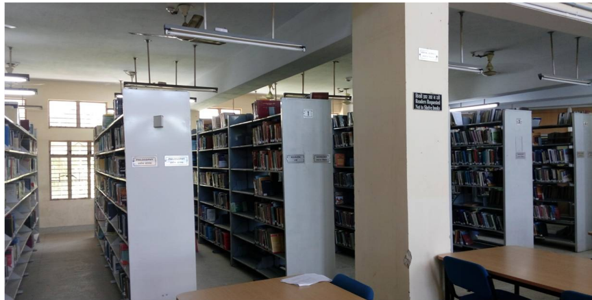
Pic 3.11.3: Stack area of Rabindra Library, Assam University