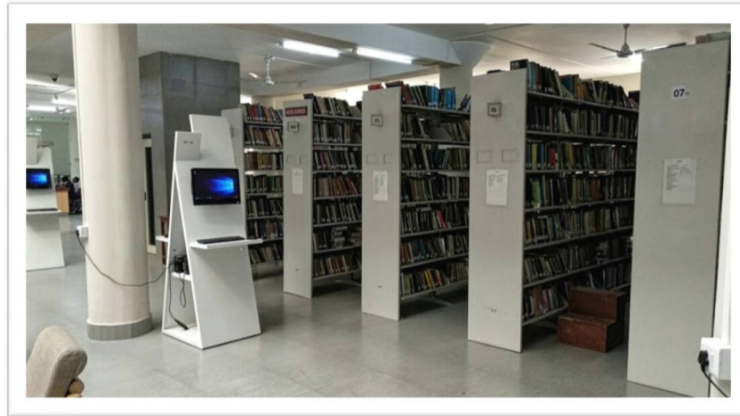
Pic 3.7.2: Stack area of Lakshminath Bezbaroa Library, Dibrugarh University