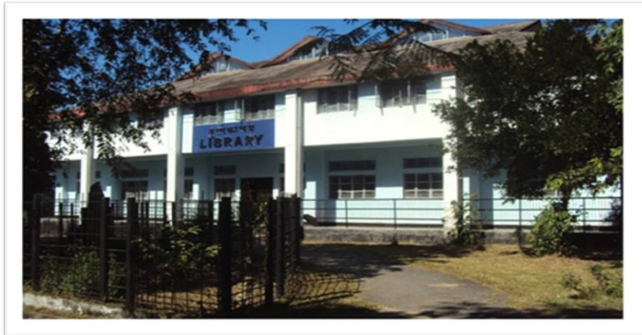
Pic 3.9.1: Front view of Library Rajiv Gandhi University