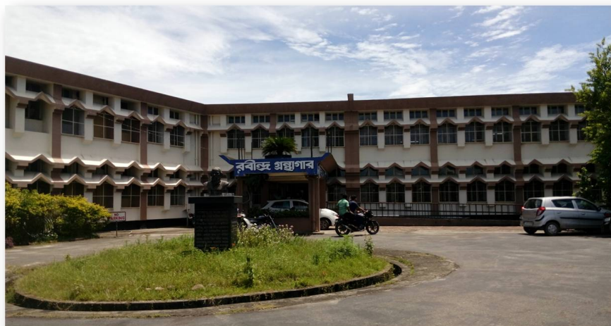
Pic 3.11.1: Front view of Rabindra Library, Assam University

Rabindra Library is the Central Library of Assam University. Assam University came into existence in 1994 after enactment of the Assam (Central) University Act 1989. Through its pursuit, Assam University is in the process of making itself an institute of excellence. The Library was also established in the year 1994 along with the University. The library is housed in a two storied building. Assam University main campus is situated at Dargakona, about 20 kms away from Silchar. The campus is set amid sprawling hillocks and typical landscape of north east. The campus is spread over 600 acres and provide an ideal environment for the researchers, students and the people interested in academic excellence. The other campus of the university is situated at Diphu in the district of Karbi Anglong, Assam. Library collection is as follows: Books – 128763 (as on 31.03.2018), Journal (National+ International) – 122, E-Journals (Subscribed + Consortia) – 8200+, Back Volume – 8742. Koha ILMS is used for automation. D-Space open source software is used for digitization ( www.aus.ac.in/library ).