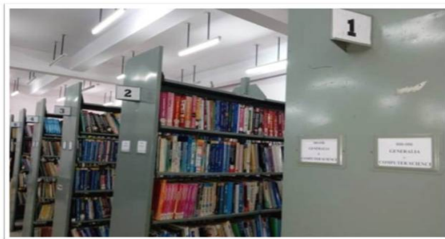
Pic 3.4.2: Stack area of Central Library, Tripura University