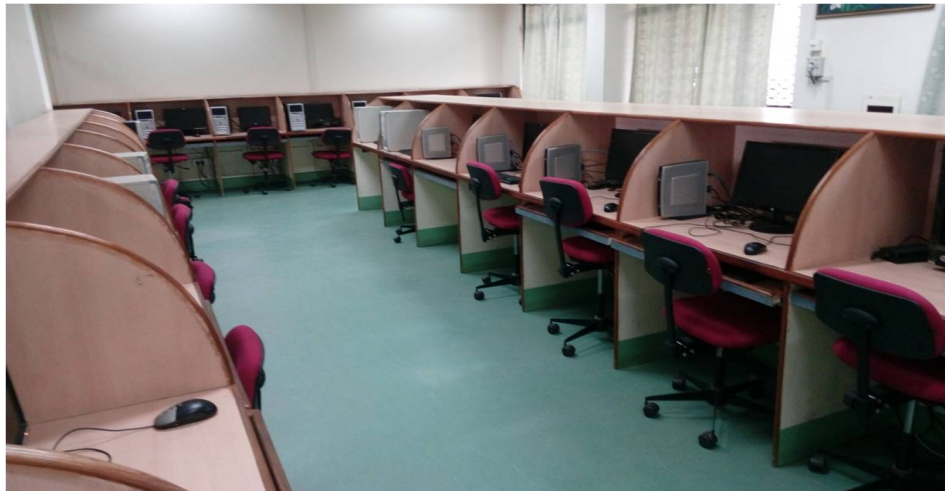
Pic 3.8.3: E-resource centre of Library, North Eastern Hill University