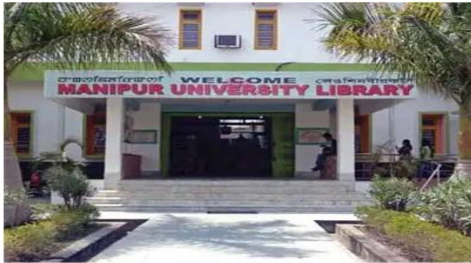
Pic 3.10.1: Front view of Manipur University Library