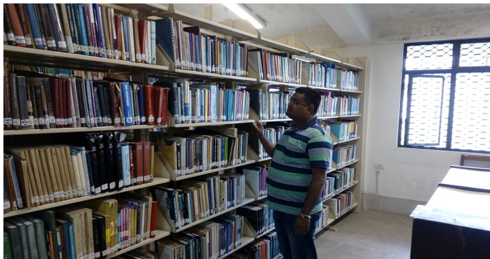
Pic 3.8.2: Stack area of Library, North Eastern Hill University